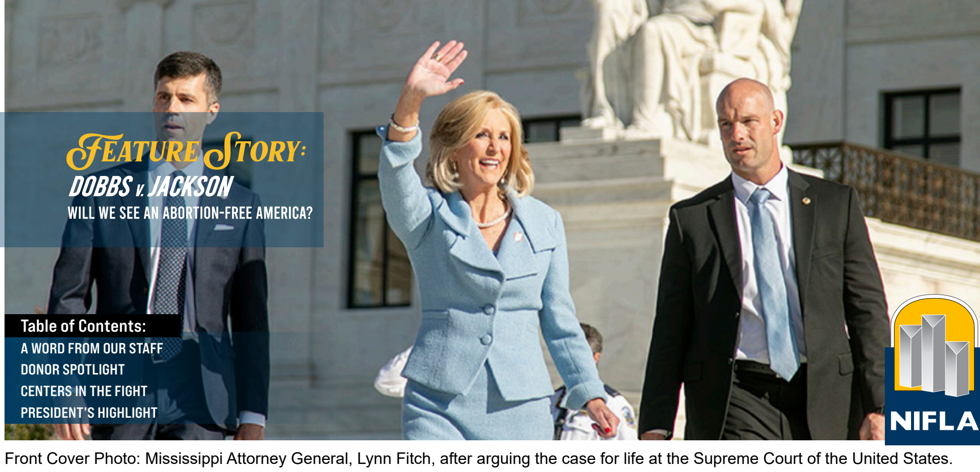
Front Cover Photo: Mississippi Attorney General, Lynn Fitch, after arguing the case for life at the Supreme Court of the United States.